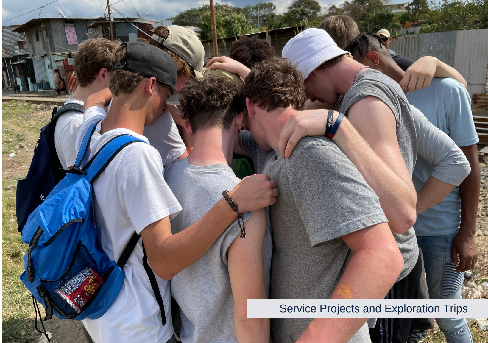
Service Projects and Exploration Trips